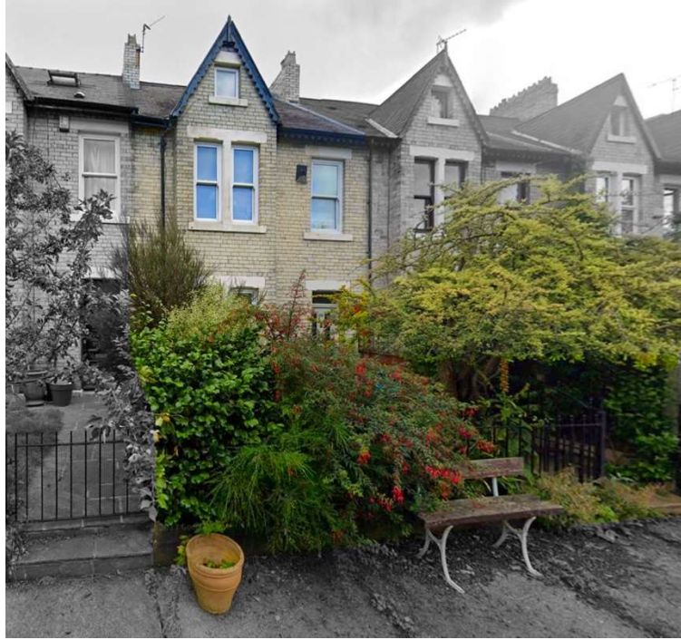
14 Holmside Place, Heaton. 2022.