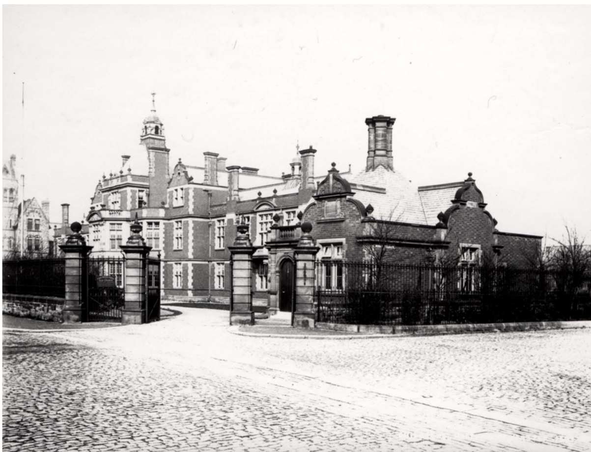
026745: Fleming Memorial Hospital Jesmond