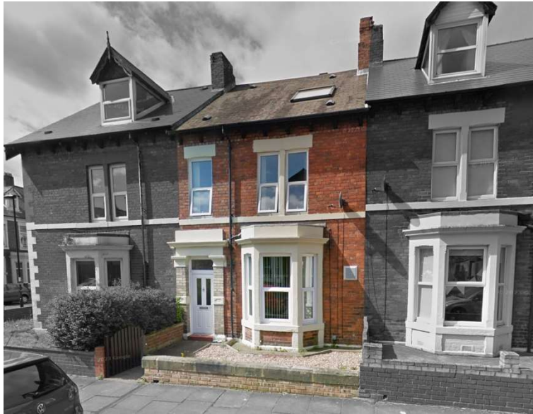
37 Heaton Hall Road, Heaton. 2016.