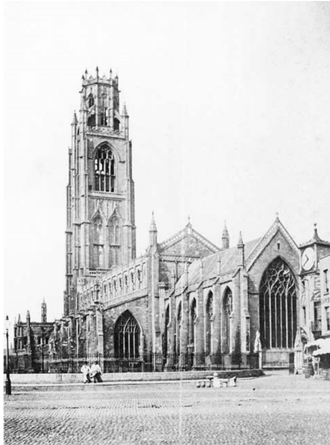
Photograph taken 1850 - 1862