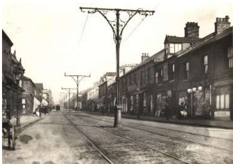
Figure 2 – Shields Road in c.1900 X