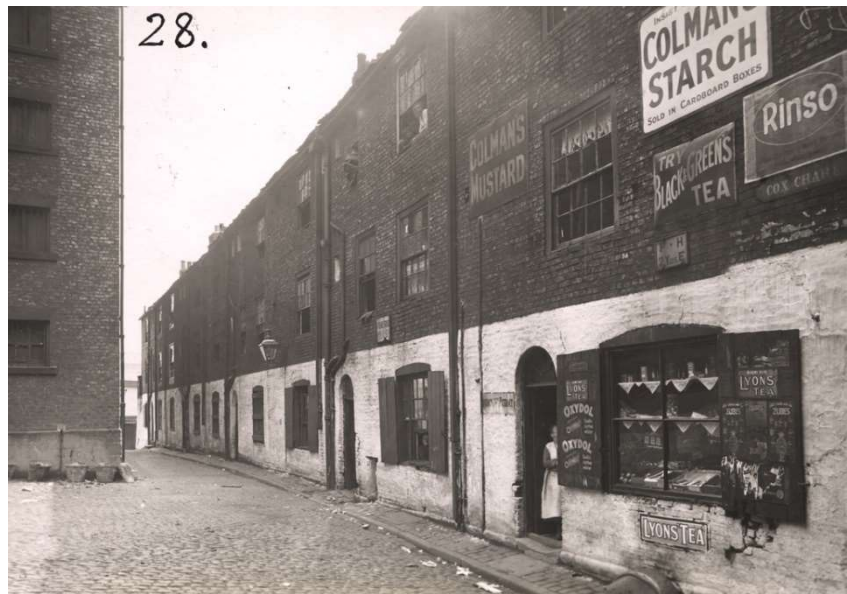
Figure 1 – Cox's Chare in c.1935 J

Cox's Chare, through its history, has been called Cock's, Coxtan's, Cox and Cockis Chare H ; likely named after Ralph Cock, the mayor and Alderman of Newcastle upon Tyne in 1653 I . In the late 1800s and early 1900s, it was a narrow alleyway between Pandon and Quayside lined with warehouses.